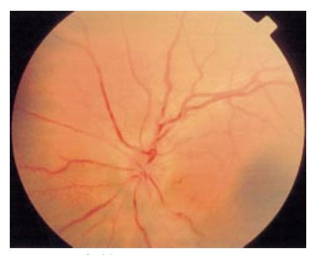
Figure 1 Acute fundal appearance in LHON.

The retinal nerve fibre layer gradually degenerates and after six months optic atrophy is a universal feature of LHON. If a patient is only seen at this stage, it can be difficult to exclude other possible causes of optic atrophy, especially if there is no clear maternal family history. In these cases, molecular genetic testing is warranted. The extent of final visual recovery