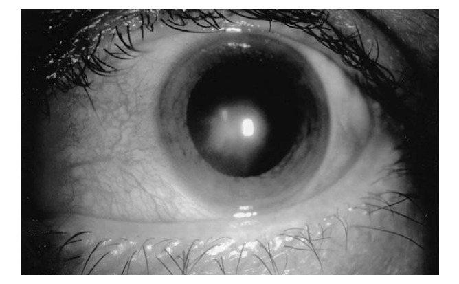
Fig. 1. Diffuse anterior scleritis. Note dilated blood vessels persist despite instillation of phenylephrine drops (pupil is dilated). The reflex on the cornea is as a result of flash photography and does not represent keratitis.