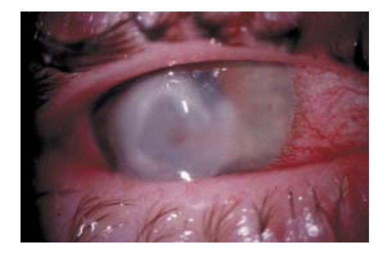
Figure 1. P. aeruginosa infectious keratitis

or to biomaterials such as contact lenses or lens cases was the focus of many research efforts. It was intuitive that adherence in some form must be an essential aspect in the development of infection in order to allow bacterial retention in the host and the expression or action of other virulence mechanisms or factors. The goal of this research was the identification of a molecule(s) on P. aeruginosa that mediated attachment to specific receptors on any given surface, with the aim of blocking these interactions and preventing infection. Unfortunately, after more than two decades of research, this goal remains elusive. Several P. aeruginosa surface molecules including pili, flagella, outer membrane proteins and lipopolysaccharide (LPS) can modulate adherence to the cornea.5,6,7 Furthermore, while the glycolipid asialo-GM1 has been identified as a receptor for P. aeruginosa binding to mammalian cells,6,8 it may not be a major receptor,9 with P. aeruginosa also adhering well to other molecules on the