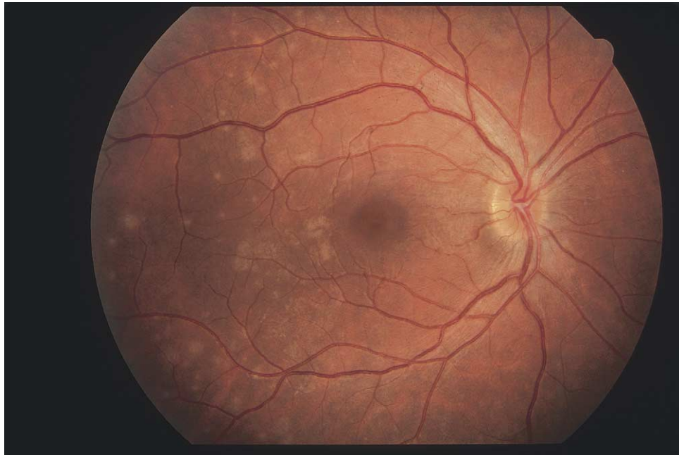
FIGURE 4. Multiple evanescent white dot syndrome (MEWDS) is characterized by the presence of subtle white lesions located in the posterior fundus, occasionally assuming a “wreath-like” pattern. Optic disk edema is common.

• BIRDSHOT CHORIORETINOPATHY Gass and Maumenee published nearly simultaneously descriptions of a new, distinctive, posterior uveitis with radiating, deep, choroidal lesions. 23,24 What appeared to Gass to be a depigmentation similar to that seen in vitiligo of the skin resembled