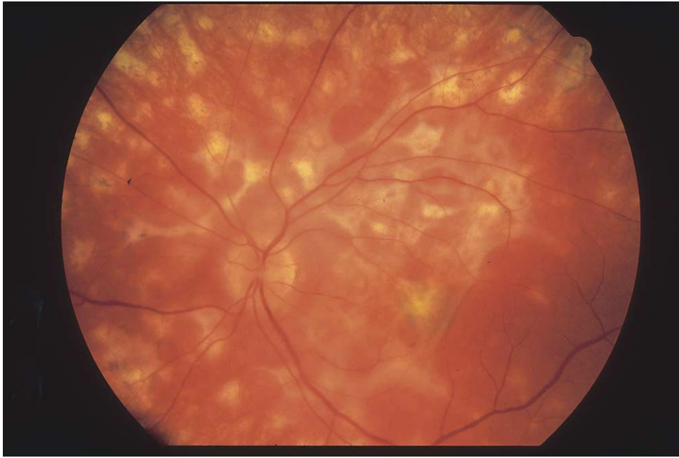
FIGURE 5. Multifocal choroiditis with panuveitis (MFC) manifests with multiple inflammatory lesions located at the level of the retinal pigment epithelium and choroid. Vision loss usually is related to the development of choroidal neovascularization.