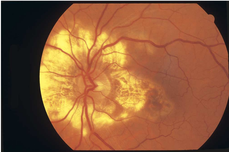
FIGURE 6. Serpiginous choroiditis is characterized by the presence of active and inactive lesions in the posterior fundus (usually in a peripapillary distribution). Acute lesions are slightly ill-defined, gray-white, jigsaw puzzle-shaped areas located adjacent to atrophic scars.

remarkably well and the characteristic fundus appearance is a key feature in diagnosis. Birdshot chorioretinopathy is probably the preferred term currently, although Gass's atlas still indexes the disease as vitiliginous chorioretinitis. 25