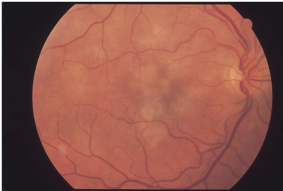
FIGURE 1. Acute posterior multifocal placoid pigment epitheliopathy (APMPPE) is characterized by the sudden onset of multifocal yellowish-white placoid lesions located at the level of the retinal pigment epithelium. APMPPE is usually bilateral and symmetric.