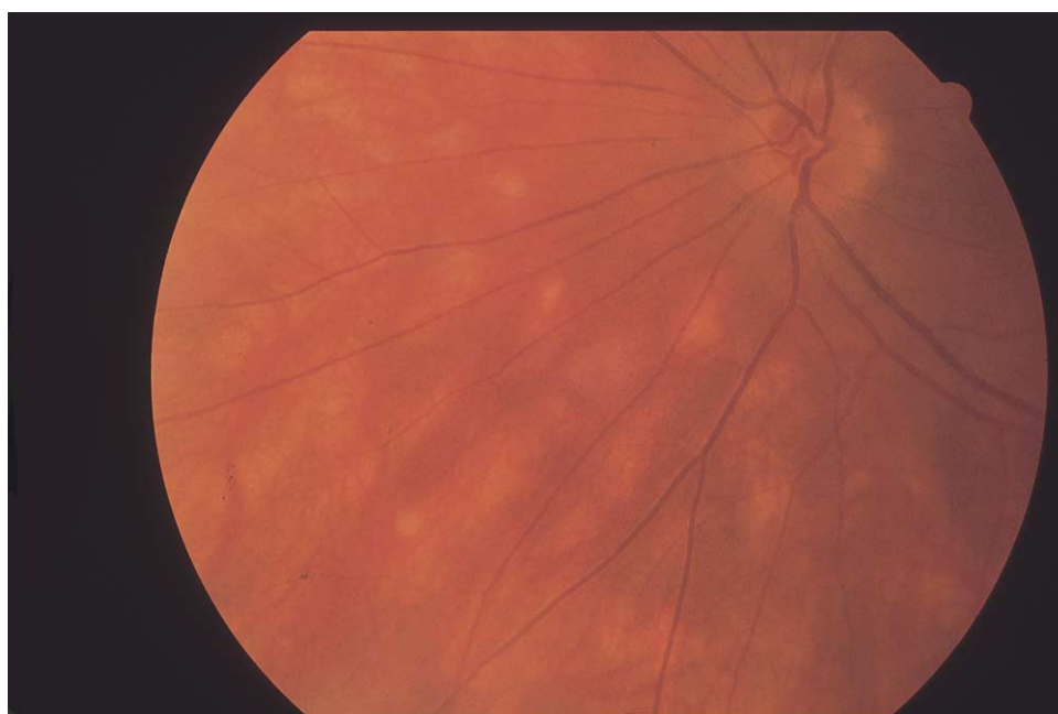
FIGURE 2. Birdshot chorioretinopathy is characterized by radiating cream-colored, oval spots located at the level of the retinal pigment epithelium. The lesions are most notable in the posterior fundus nasal to the optic disk.

associated central nervous system (CNS) vasculitis. Although extremely rare, there are reports of death associated with CNS vasculitis that developed within several weeks after the onset of APMPPE. 22 No systemic investigation is necessary for typical APMPPE, although a thorough sys-