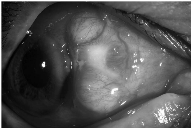
FIGURE 1. Case 2. S. pneumonia scleritis after pterygium surgery. A large scleral nasal abscess with associated purulent material noted centrally. After sclerectomy and drainage with subconjunctival, topical, and oral antibiotics, there was complete resolution of the scleritis 14 days after initiation of the treatment.