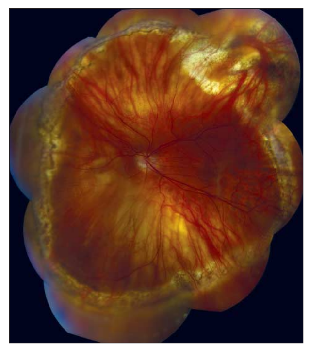
Figure 1. A 54-year-old man referred for evaluation 3 months after pars plana vitrectomy, endolaser treatment, and intraocular gas injection in the left eye. The posterior segment image shows a myopic fundus appearance (with a tilted optic disc and scleral crescent) and chorioretinal scars consistent with prior 360° laser retinopexy. Most significantly, a 360° anterior peripheral retinal detachment can be seen through the associated large retinal breaks (at the 6-o'clock and 9-o'clock positions) are not here visualized.

sistant. Additionally, contact-based wide-angle viewing systems may provide a larger field of view compared with noncontact systems.<sup>8</sup>